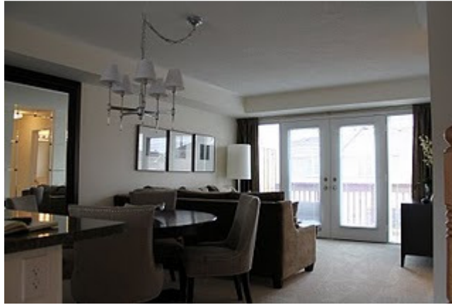
A charming dining nook leads into wider living space (note the deck off the back!)