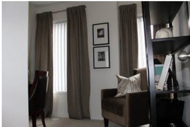
The ample upstairs office